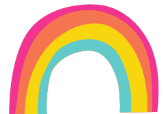
Topsy Turvy £498.20