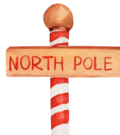
Xmas Light Trail £1183.39