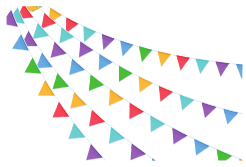
NB Village Day £522