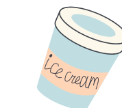
Year 2 Leavers Café £200.48