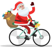
Parent Fundraiser £740.00