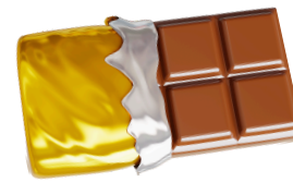
Wonka Bars £372