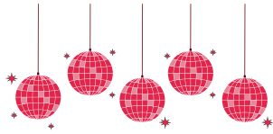
October Disco £321.08