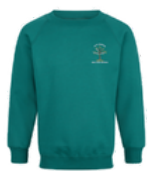
New Year R Events £250