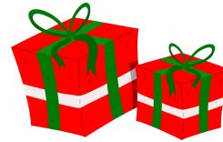
Xmas Pop Up Shop £391.84