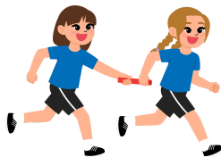
Romsey Relay £670