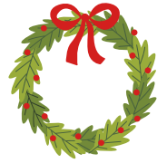
Wreath Workshop £100