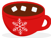
Xmas Cafés £150