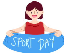
Sports Day Café £140.60