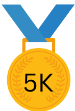
Baddesley 5k £2500